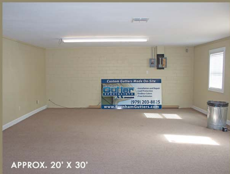
APPROX. 20' X 30'