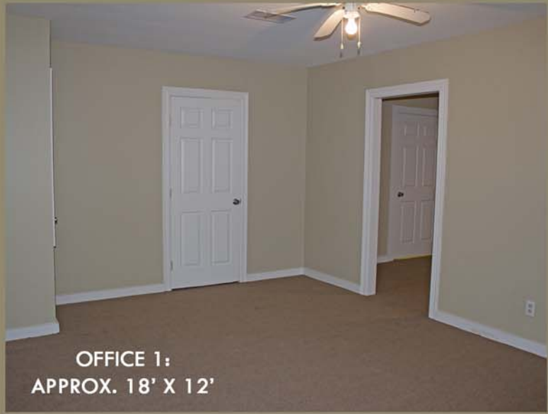
OFFICE 1: APPROX. 18' X 12'