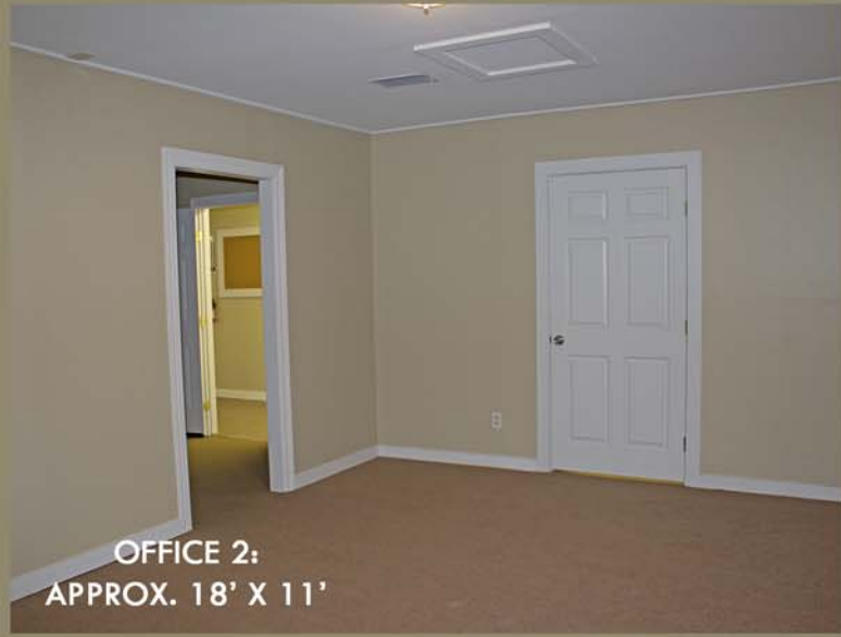
OFFICE 2: APPROX. 18' X 11'

Commercial building located just off of the corner of East Alamo and Chappell Hill Street. Building has 1426 SF with 20'X30' lobby/reception area and two large offices. Recent updates include 30 year comp shingle roof, CHA, hardi-plank front with new windows. Property is zoned B1.